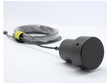
Single & Dual Frequency Echosounder Units