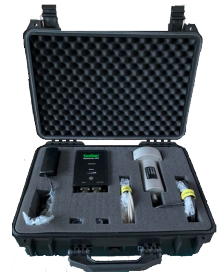
Rugged Shipping Case