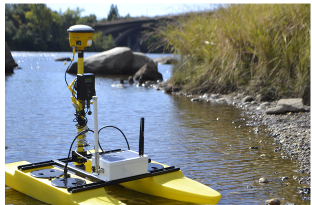
Unit can be integrated into remote / autonomous survey vessels

Seafloor Systems, Incorporated | 4415 Commodity Way | Shingle Springs, CA 95682 | USA